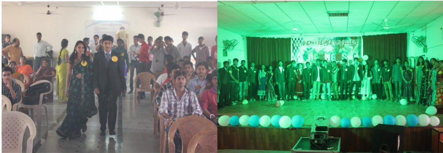
Contestants for Mr & Miss fresher

About the Activity (few lines): This event was organized after class hours from 2:00 PM to 5:00 PM with cultural items in between Intro,Talent & questionnaire rounds conducted for I Year.The final round winners were awarded with Mr & Miss fresh face, Mr & Miss Graceful , Mr & Miss Fresher.