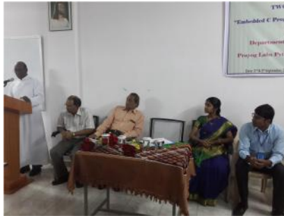
Day 1: Inaugural Session